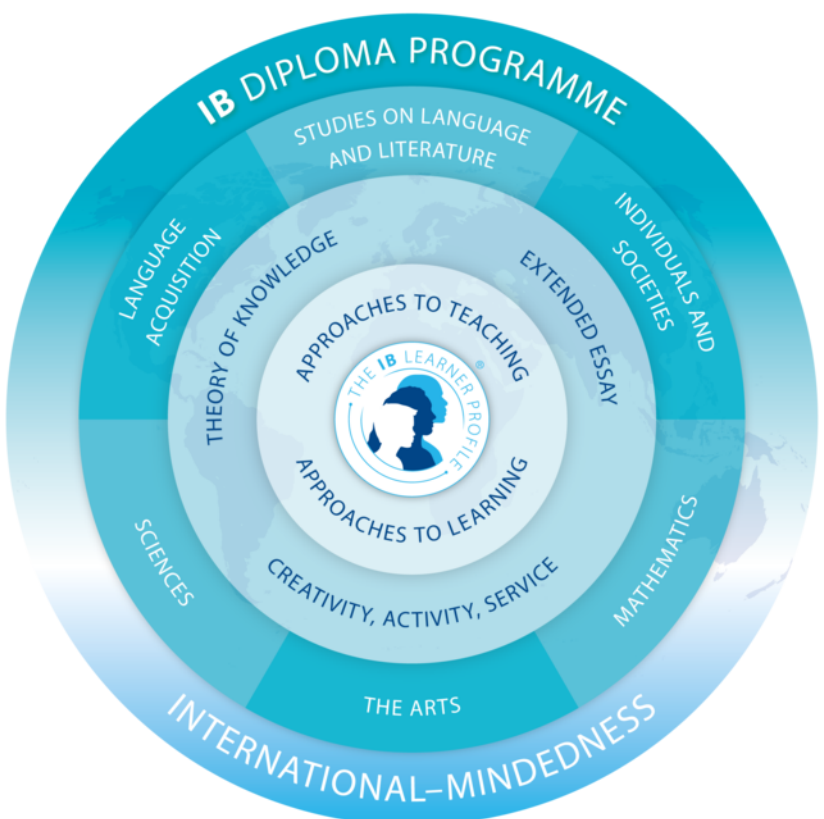
Figure 1 The Diploma Programme model

The course is presented as six academic areas enclosing a central core (see figure 1). It encourages the concurrent study of a broad range of academic areas. Students study two modern languages (or a modern language and a classical language), a humanities or social science subject, an experimental science, mathematics and one of the creative arts. It is this comprehensive range of subjects that makes the Diploma Programme a demanding course of study designed to prepare students effectively for university entrance. In each of the academic areas students have flexibility in making their choices, which means they can choose subjects that particularly interest them and that they may wish to study further at university.