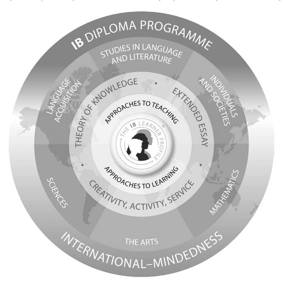
Figure 1 Diploma Programme model

The course is presented as six academic areas enclosing a central core (see figure 1). It encourages the concurrent study of a broad range of academic areas. Students study two modern languages (or a modern language and a classical language), a humanities or social science subject, an experimental science, mathematics and one of the creative arts. It is this comprehensive range of subjects that makes the Diploma Programme a demanding course of study designed to prepare students effectively for university entrance. In each of the academic areas students have flexibility in making their choices, which means they can choose subjects that particularly interest them and that they may wish to study further at university.